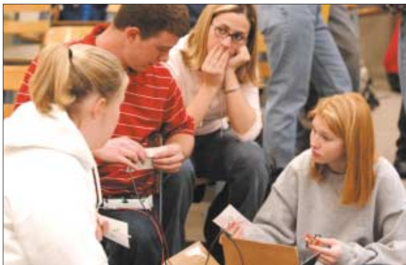
Student small group discourse in the lecture theater.

Teachers working with us have found that the RTOP is useful as a checklist for lesson planning purposes, in the mentoring and professional development of new or student teachers, and for their own personal pedagogical growth. Another commonly cited use is in defense of instructional change — for example, justifying the modeling method to administrators and parents who may be familiar with traditional instructional methods and require assistance in judging reformed teaching. Many aspects of inquiry teaching challenge traditional practice, and teachers tell us that RTOP helps validate and refocus their own journey into professional growth.